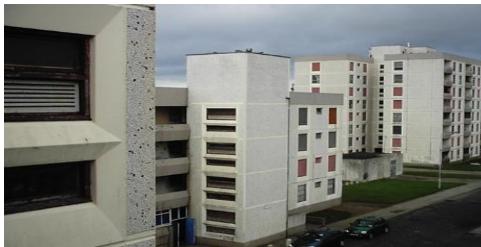
St. Michael's Estate.

Areas like St Michael's estate opposite have suffered social deprivation for years and it seems the Celtic Tiger, and the politicians who often claim the credit for it, are indifferent to its plight. The bulk of the scheme has already been demolished with the remaining tenants being housed in the last of the original blocks. Is the Celtic Tiger to leave them there? Are they to be forever the victims of developer's greed? The 32CSM assert that the people's sovereignty takes precedence over the greed of private developers and that the needs of the people take priority with elected representatives and city officials.